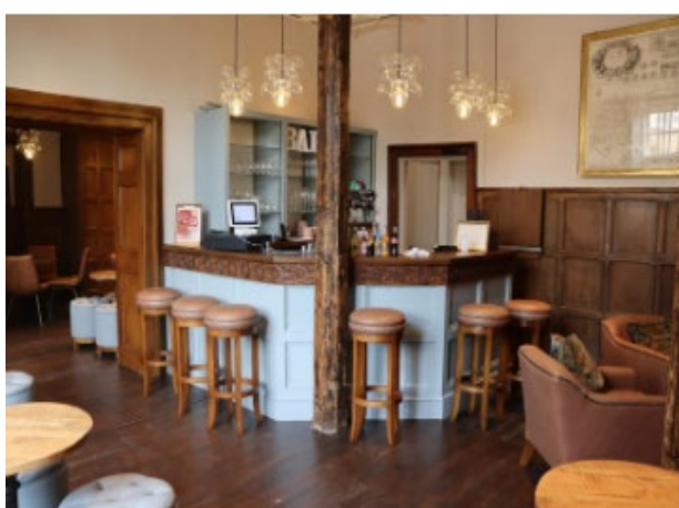
Denford Bar & Lounge (above), available for staff use