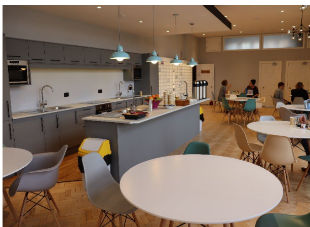
Views of New Hall (above left) and the staff room (above right), located in the main School building